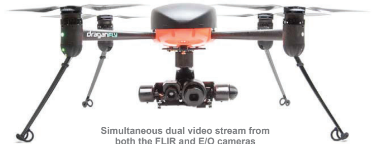
Simultaneous dual video stream from both the FLIR and E/O cameras