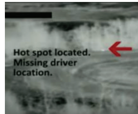
Search and Rescue